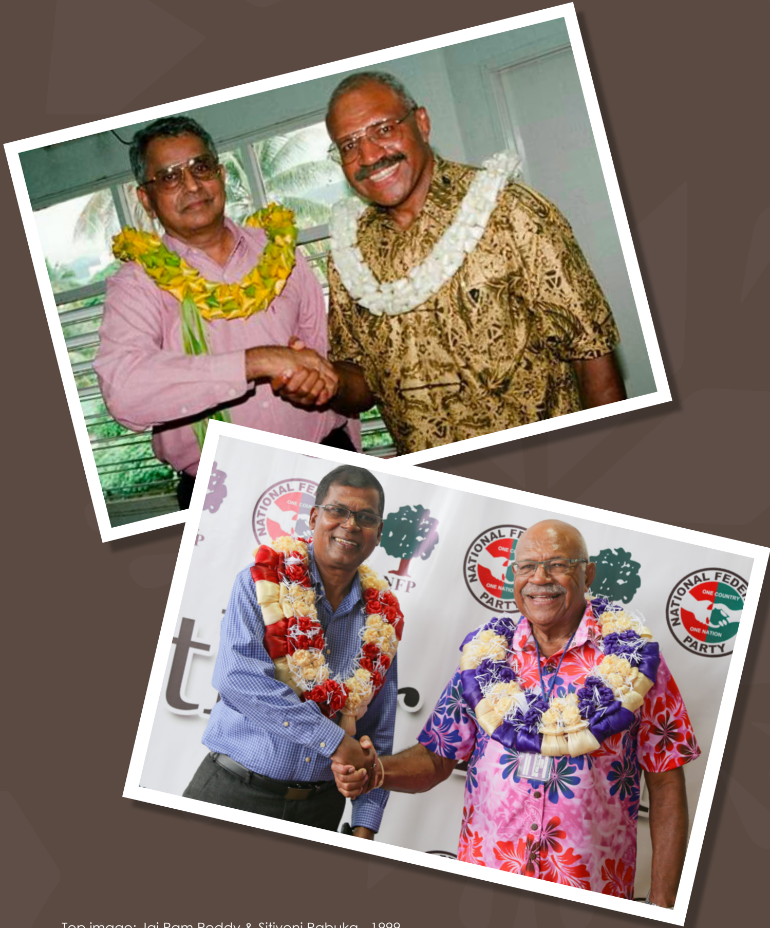
Top image: Jai Ram Reddy & Sitiveni Rabuka - 1999 Bottom Image: Biman Prasad & Sitiveni Rabuka - 2022